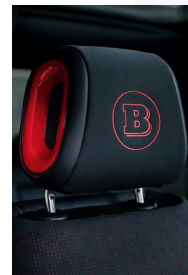
BRABUS APPEARANCE PACKAGE