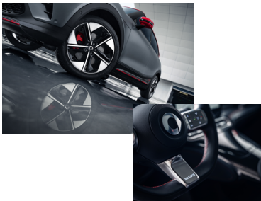
GRIPPY ALCANTARA STEERING WHEEL