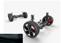
BRABUS DRIVING MODE, AWD DRIVE TRAIN

0-100 KM/H IN 3.9 S, 315 KW, 543 NM Combined electricity consumption in kWh/100 km: 17,9 (BRABUS); Combined CO2 emissions in g/km: 0; Electric range (WLTP) in km: 400 (BRABUS)