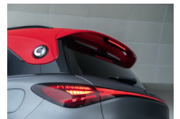
DISTINCTIVE PAINT COLOUR COMBINATIONS