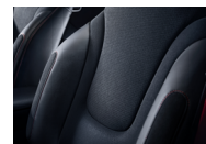
BRABUS INTERIOR MATERIALS AND COLOURS